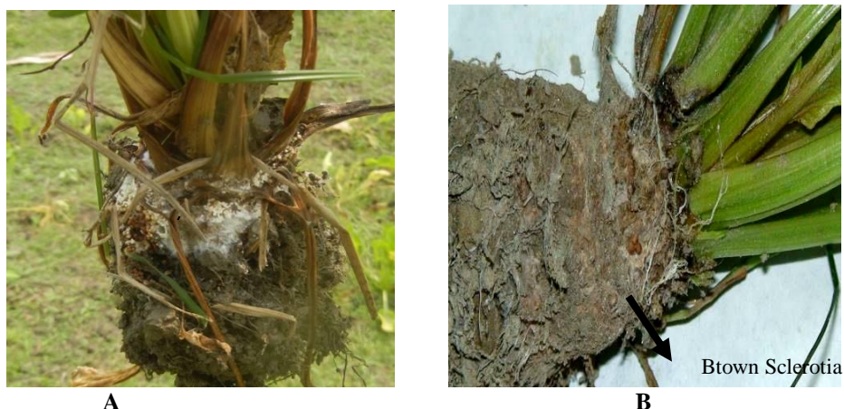
Fig. 1. Symptoms of Sclerotium rot of sugarbeet